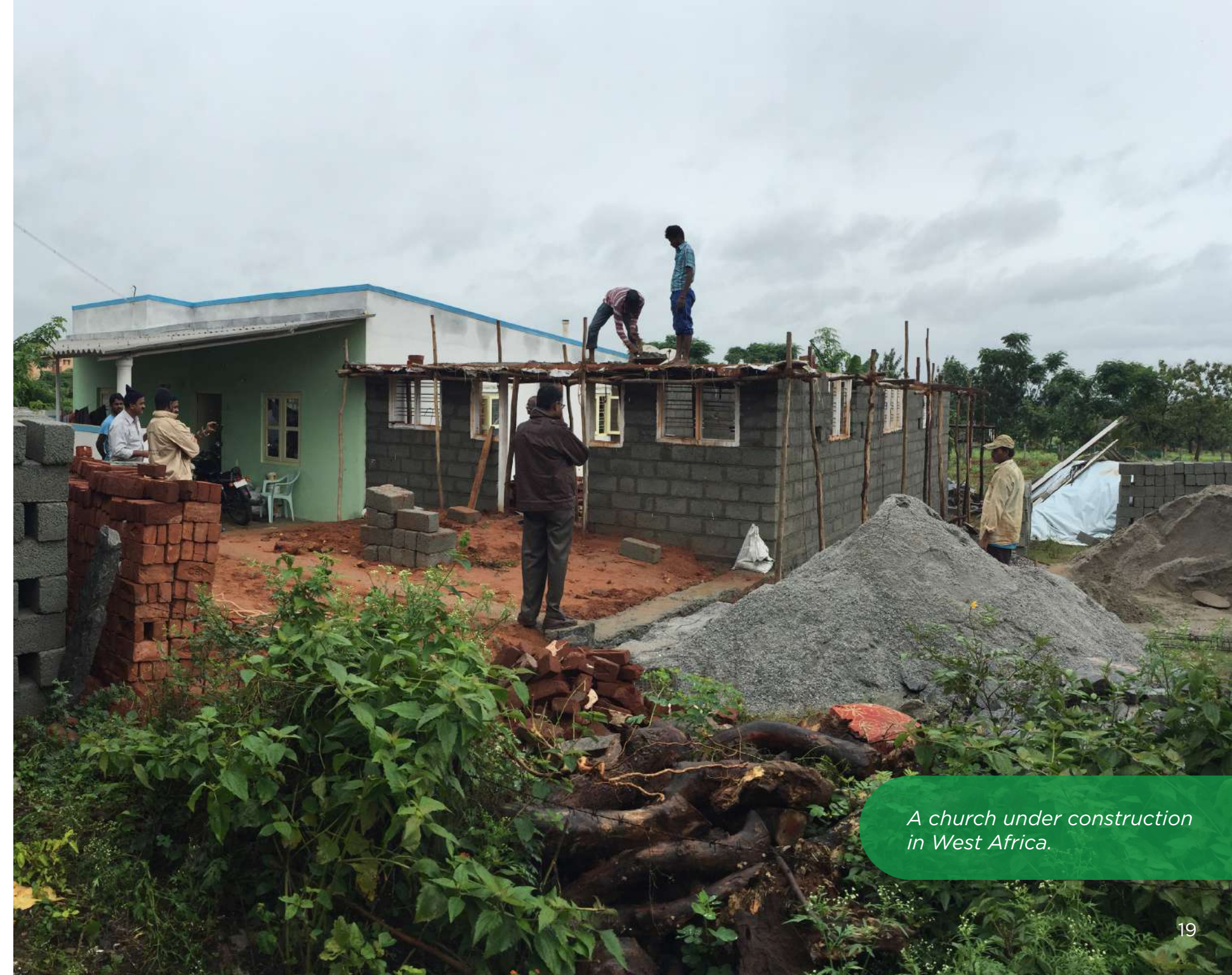
A church under construction in West Africa.