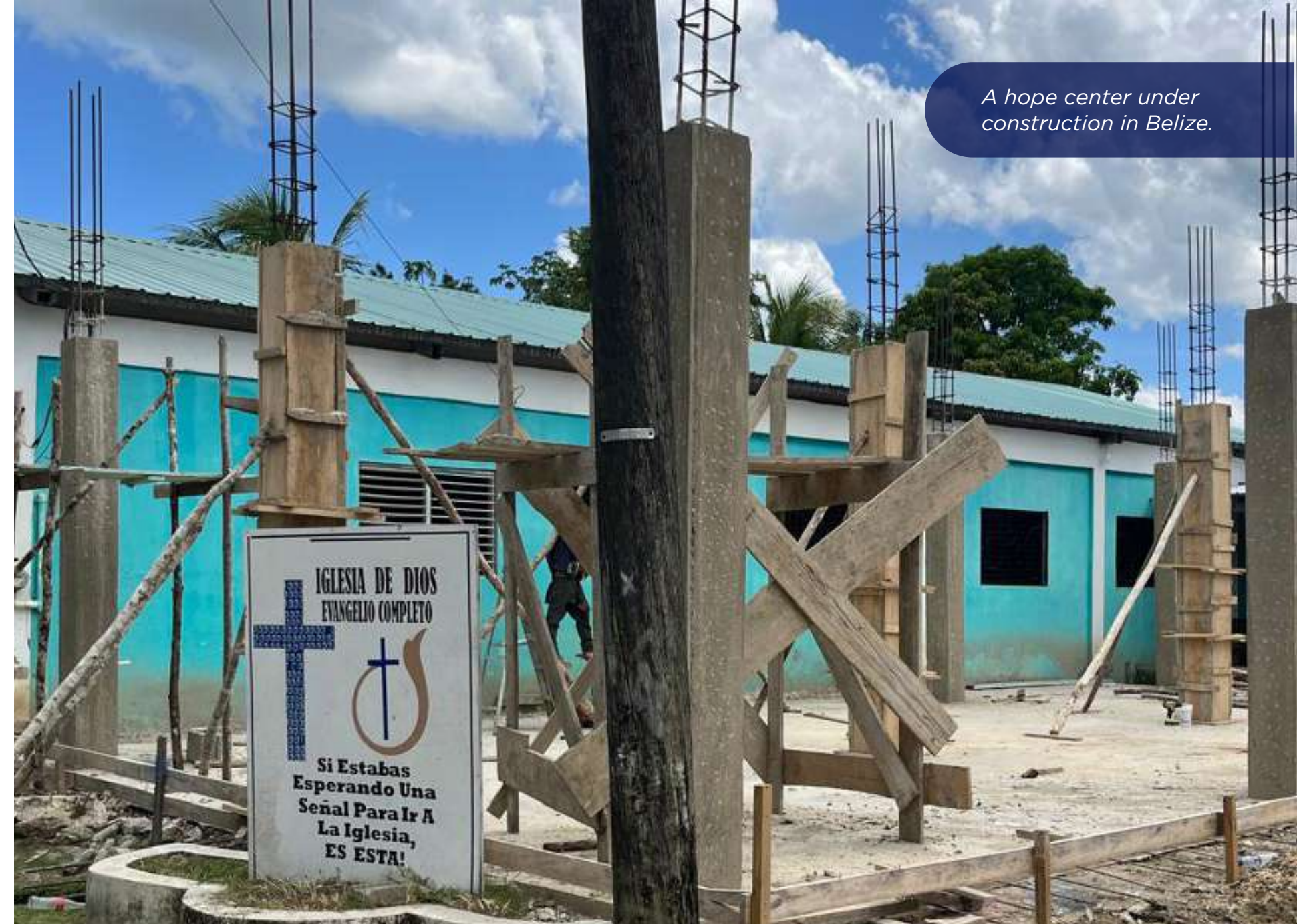
A hope center under construction in Belize.