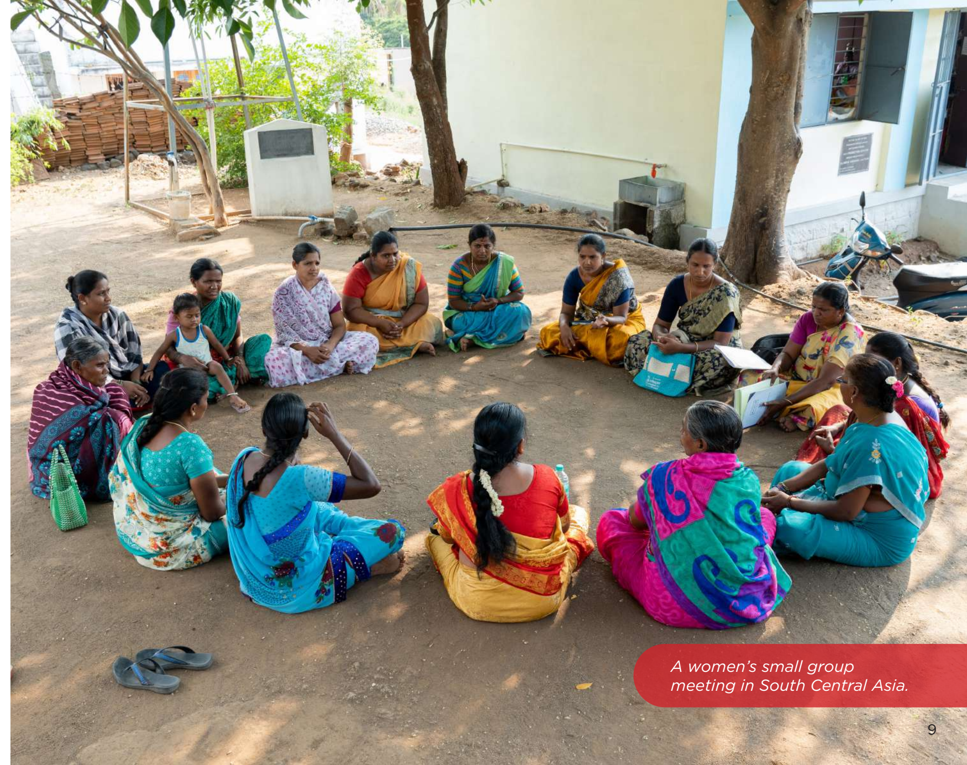
A women's small group meeting in South Central Asia.