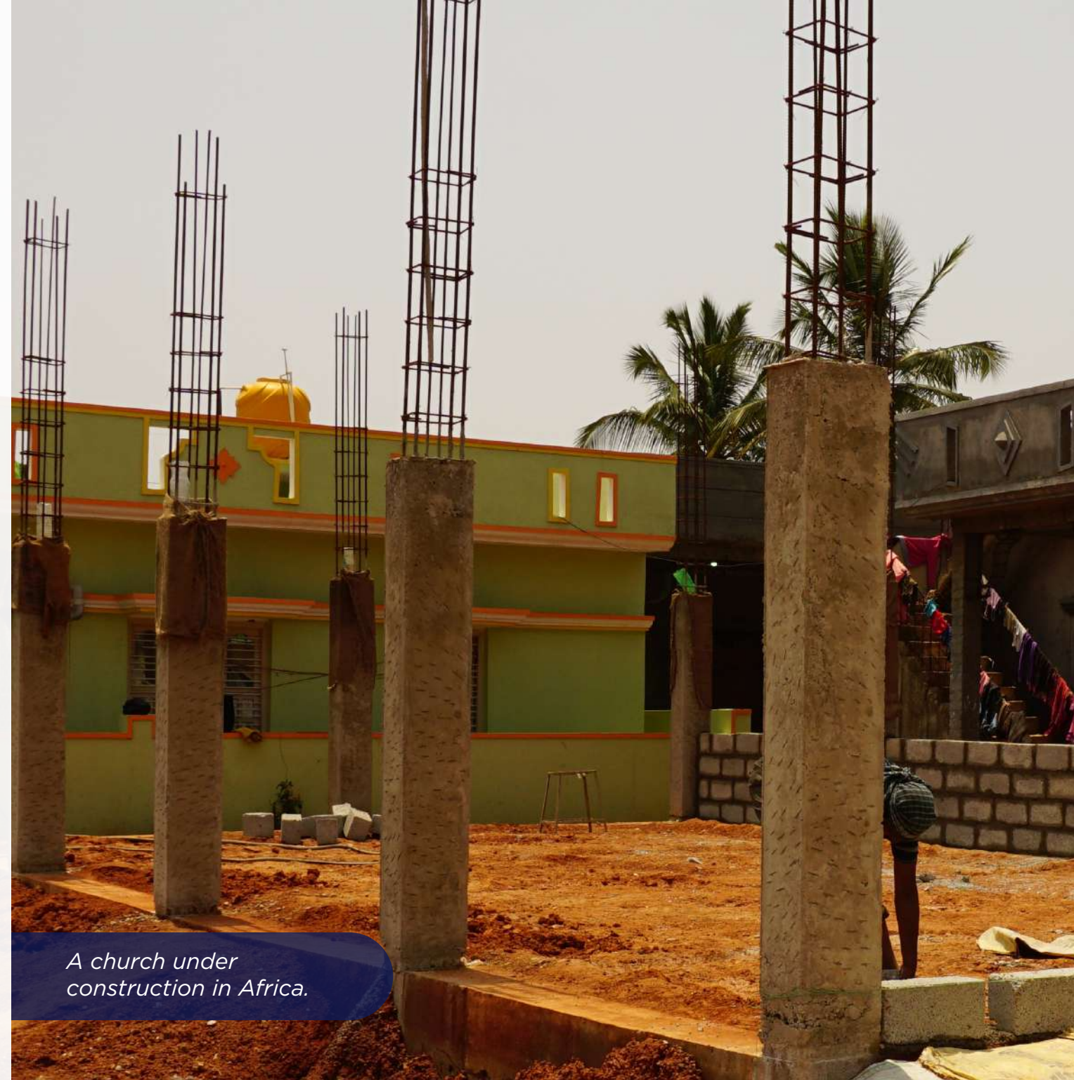
A church under construction in Africa.

ICM is deeply committed to ensuring that every dollar entrusted to the ministry is stewarded with discipline, transparency, and a clear focus on mission impact. ICM's 2025 audit affirmed our financial accountability and integrity. This year, ICM was once again accredited by ECFA (Evangelical Council for Financial Accountability), an organization that verifies high standards of financial integrity, board governance and stewardship. Our goal is to maximize deployment of resources to the field through careful cost management and rigorous financial oversight. We commit to steward the resources entrusted to us and remain deeply grateful for the generosity and partnership of our faithful donors.